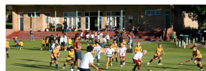
First day of J3-4 competition

For the first time, Lions have also introduced a J3/4 program , (previously known as Under 9s) to help Minkey players with the transition to hockey. We have 10 teams and are confident that this will ensure a great pool of talent to take us through the years.