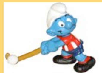
(We're all a bit camera shy)

Did you know that a number of hockey parents have now got in on the act? It began with a bunch of mums on the sidelines watching their children enjoying their hockey. It has progressed to one Women's and two Men's Vets teams in the competition this year, having a laugh, keeping fit, showing their kids that it is great to have a go, and holding their own in the comp.