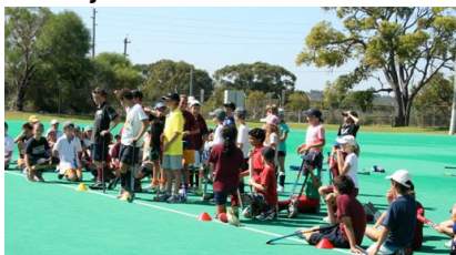
Holiday Clinic fun

The Lion's April Holiday Clinic attracted 70 kids and provided excellent skills training and lots of fun. It also provided valuable experience for our older juniors currently or considering coaching our young hockey players. Look out for news of the next holiday clinic in the July School holidays.