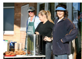
Cooking up a storm at Melvista

This competition is an important step in securing the future of the club and introducing our youngest 'cubs' to our 'den'. The competition is played on Saturday mornings and consists of 2 x 20 minute games, with a break between to allow for coaching and feedback using modified rules on half-sized fields. This unique advanced skills training program has been developed in consultation between Garry Fitzpatrick and Tristram Woodhouse .